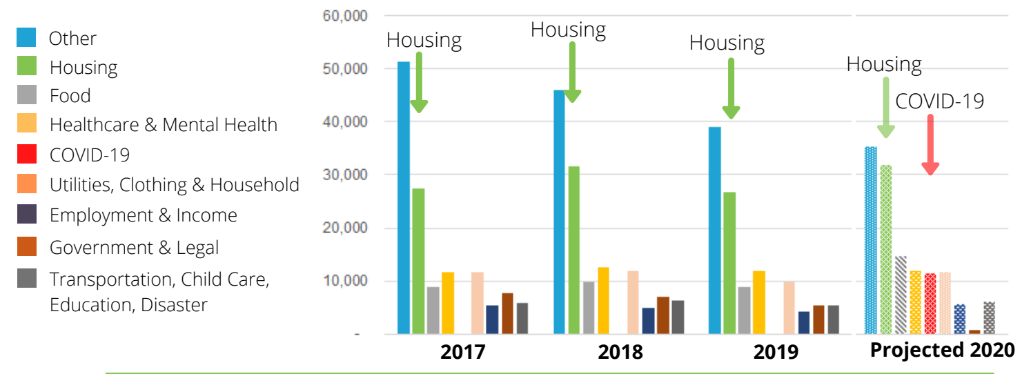
Nevada 2-1-1 Housing Related Service Requests*